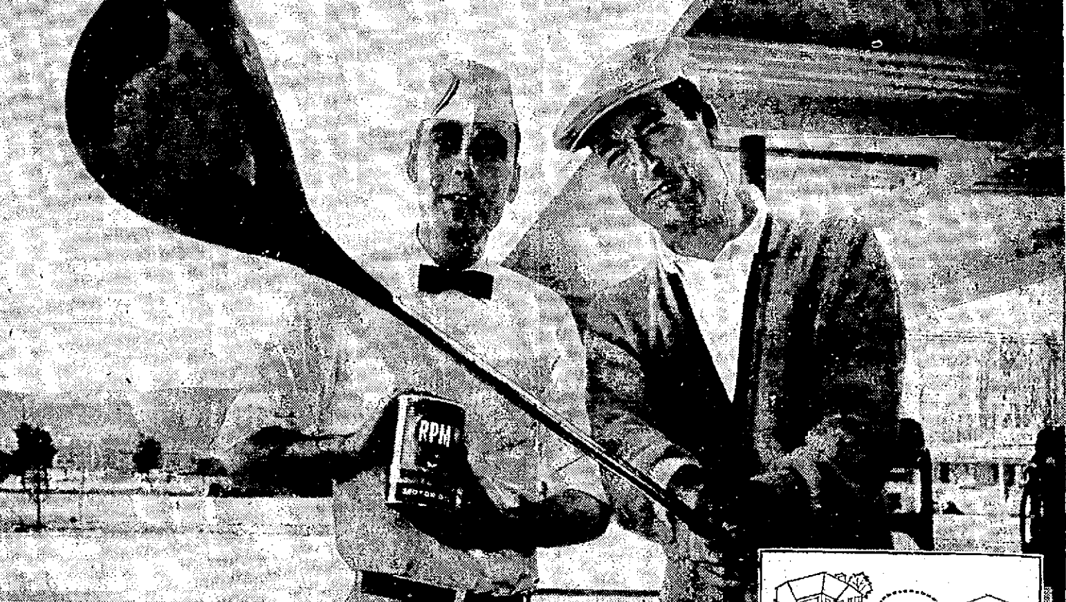
Ken Venturi, holder of a Chevron National Credit Card since 1957, is one of the nation's youngest—and best—professional golfers.

As Ken Venturi has discovered, driving gets better fast with RPM Supreme Motor Oil. It gives triple-grade protection. Flows like a light oil for fast starts...like a medium oil for short-trip driving...like a heavy oil on long highway runs. And its exclusive Detergent-Action compounding keeps parts so clean, protects them so well, engines can outlast the car itself. Try it on your car... American or foreign. RPM Supreme saves money by increasing gas mileage under all driving conditions... and cutting repair bills for the life of your car. Proved in millions of miles... in millions of cars... RPM Supreme halts engine wear for keeps!