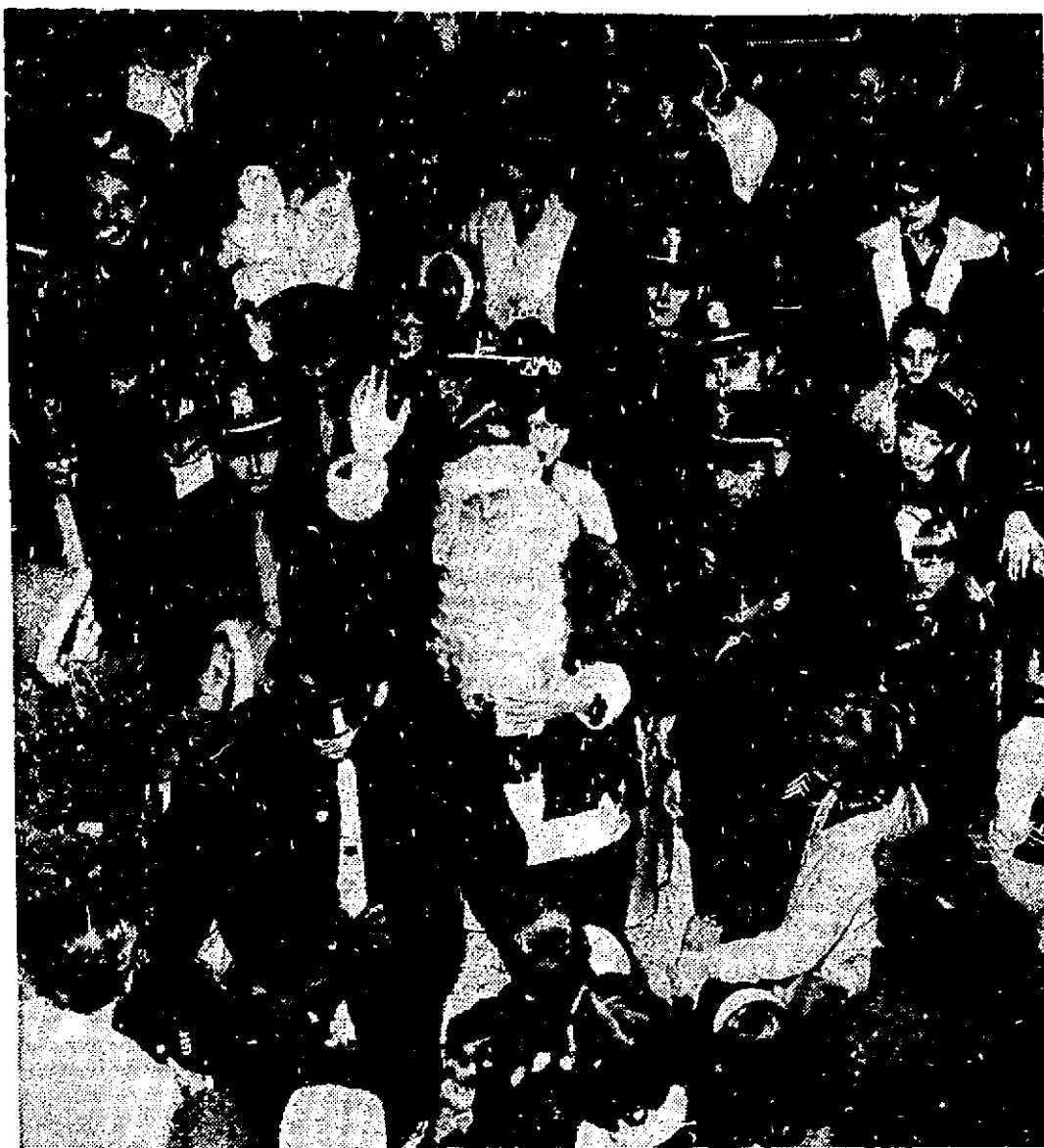
A cordon of sheriff's deputies was needed to escort Santa Claus through the crowds that were on hand to greet him when he arrived at the Cottonwood Mall Friday afternoon.